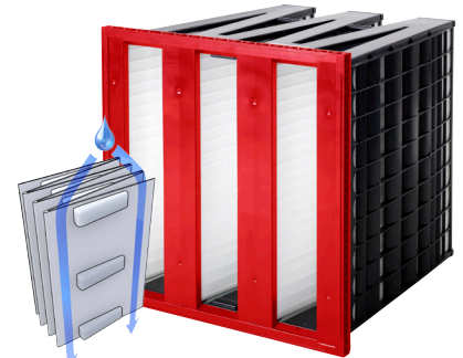
Optimum water drainage capabilities